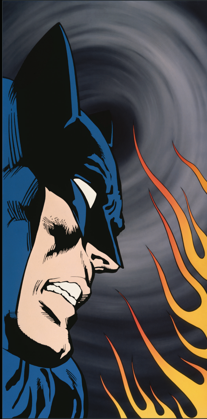
TITLE: Bat Out Of Hell SIZE: 24 inches x 48 inches MEDIUM: Oil On Canvas DATE: September 1987