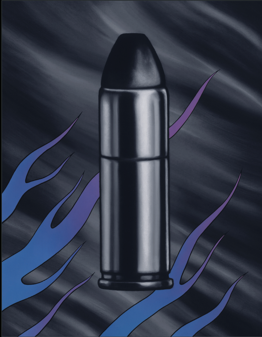
TITLE: Hell's Ticket (The Center Bullet) SIZE: 16 inches x 20 inches MEDIUM: Oil On Canvas DATE: January 1986