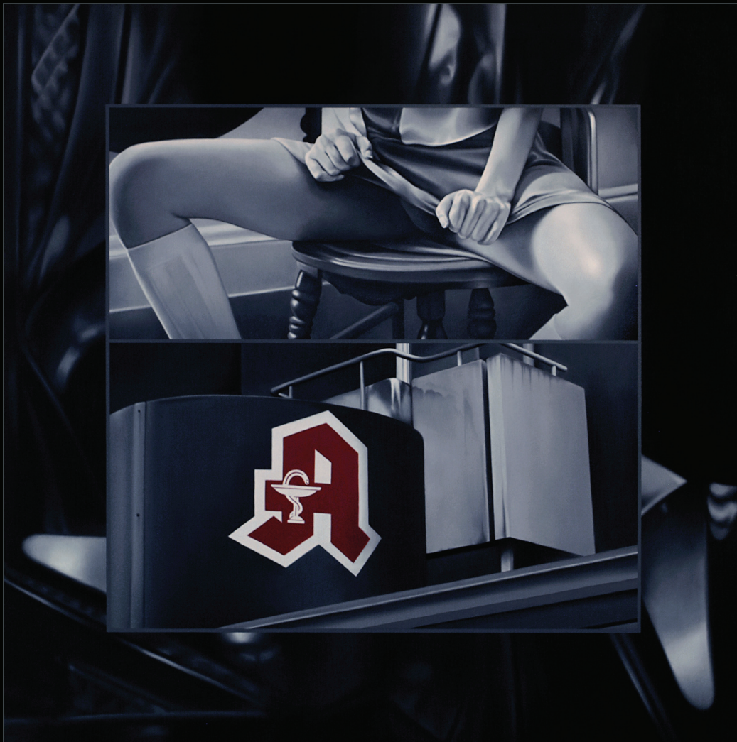
TITLE: Clinically Speaking (Berlin) SIZE: 36 inches x 36 inches MEDIUM: Oil On Canvas DATE: June 2007