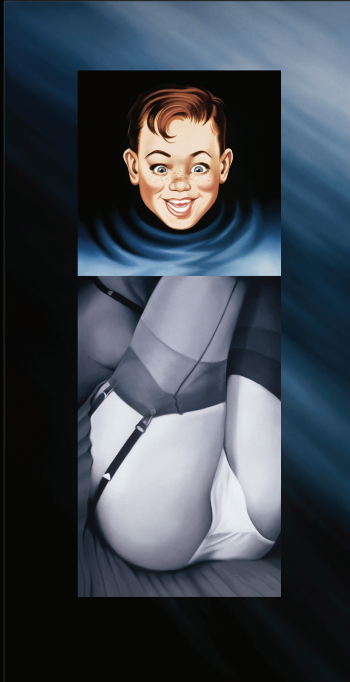
TITLE: Youth Number Two - A Lost And Childish Heart SIZE: 30 inches x 58 inches MEDIUM: Oil On Canvas DATE: May 1997