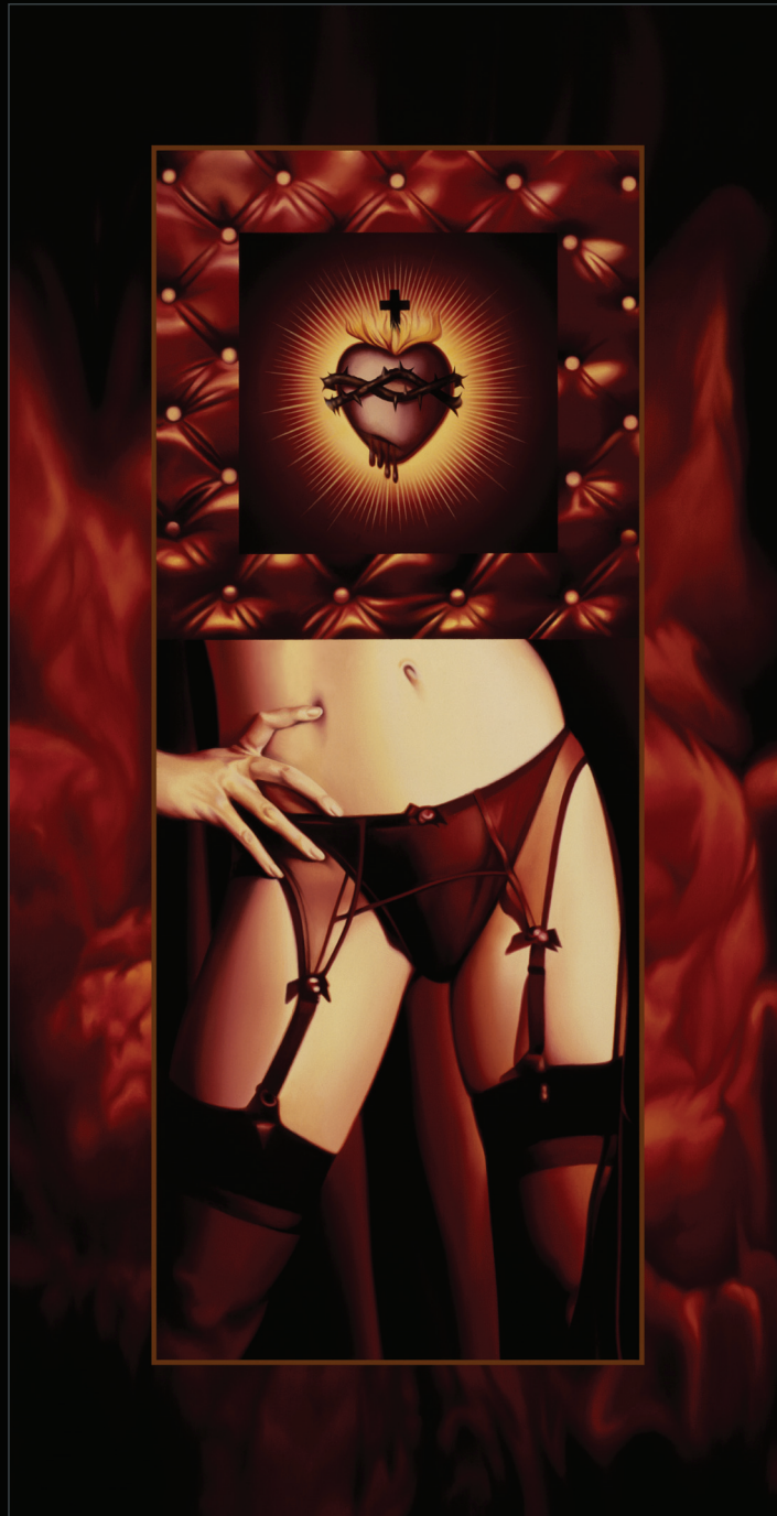
TITLE: Here Comes A Twister (To Twist Off Your Head) SIZE: 30 inches x 58 inches MEDIUM: Oil On Canvas DATE: December 2000