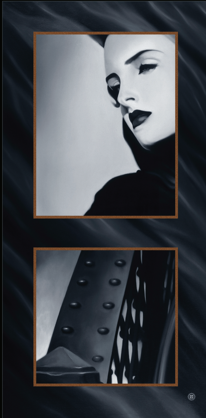
TITLE: Cold As Steel SIZE: 24 inches x 48 inches MEDIUM: Oil On Canvas DATE: May 1988