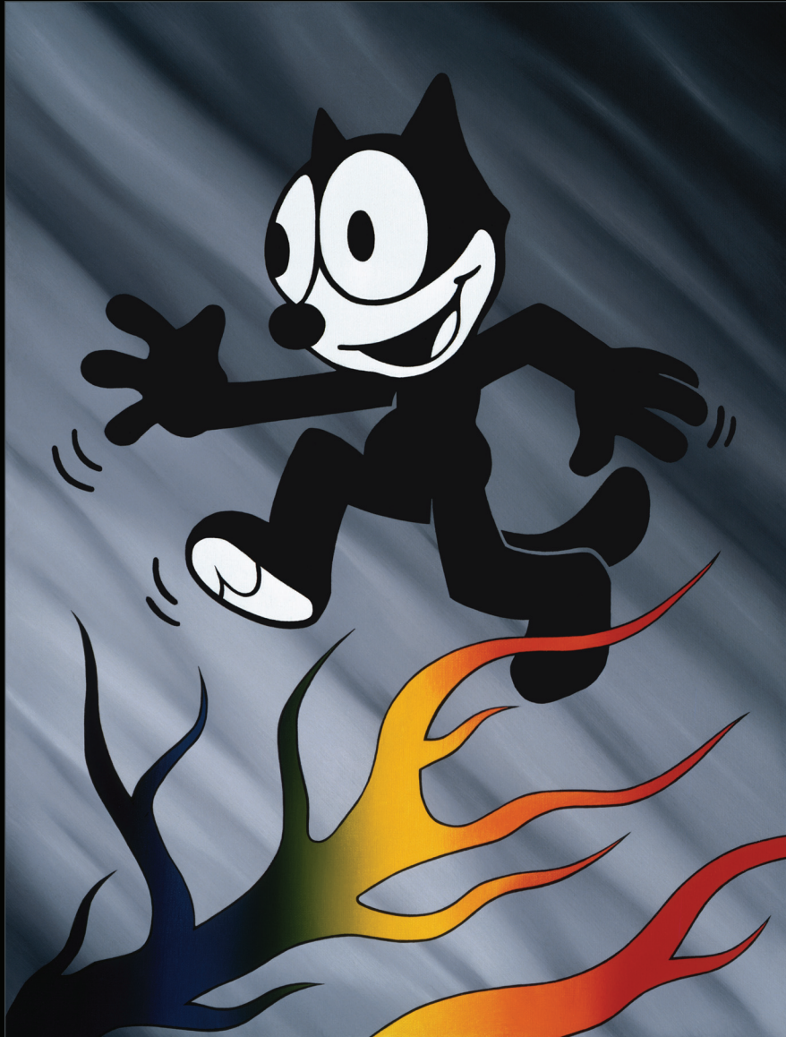
TITLE: Felix Goes To Hell SIZE: 18 inches x 24 inches MEDIUM: Oil On Canvas DATE: December 1985